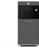
ProJet MJP 3600W

High-throughput MultiJet Printing production of precision casting patterns